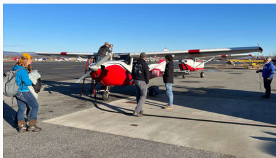
Arriving in Fairbanks