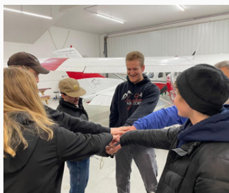
The team ready to leave