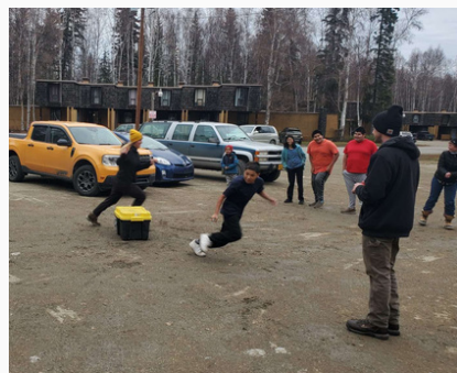
Playing games with the kids