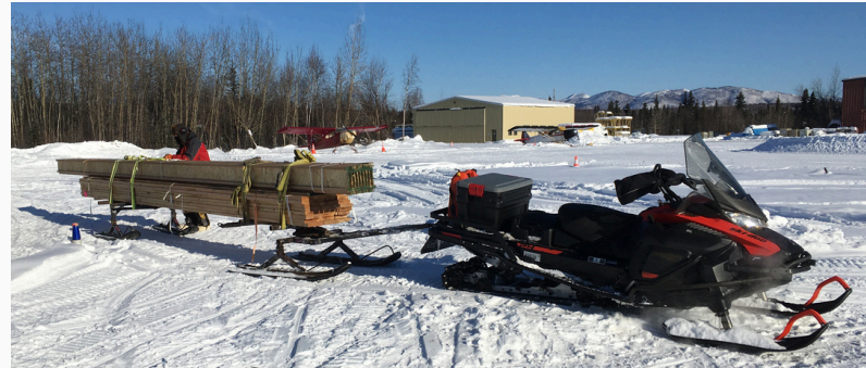
Strapping down a load