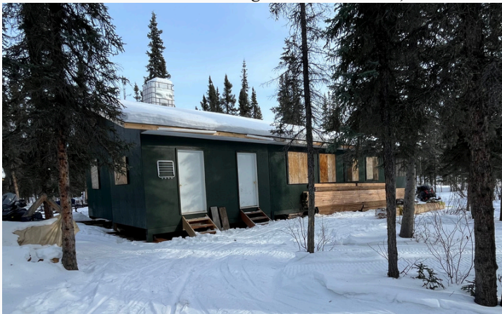
Lodge with the new buildig supplies