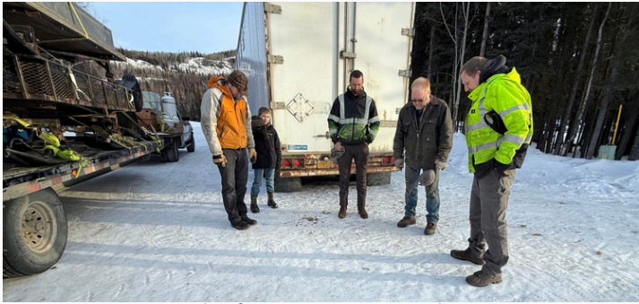
Prayer before starting the trip!