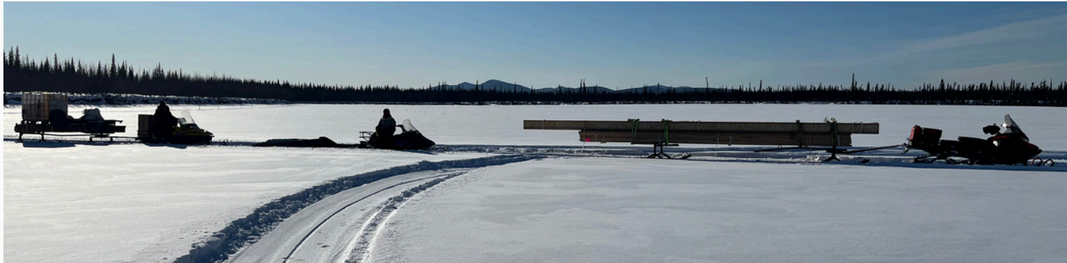
Hauling out the 32' I joists and other supplies for the Lodge addition