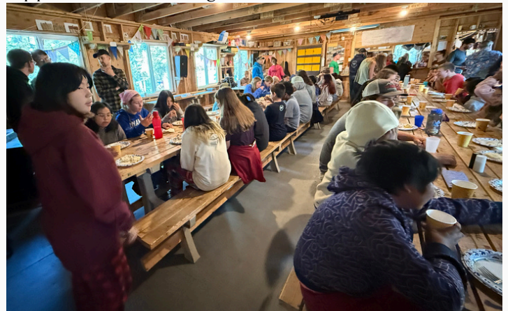
Full Lodge this past summer